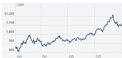
Chart from nytimes.com

pulling back and ending just above $1,100.